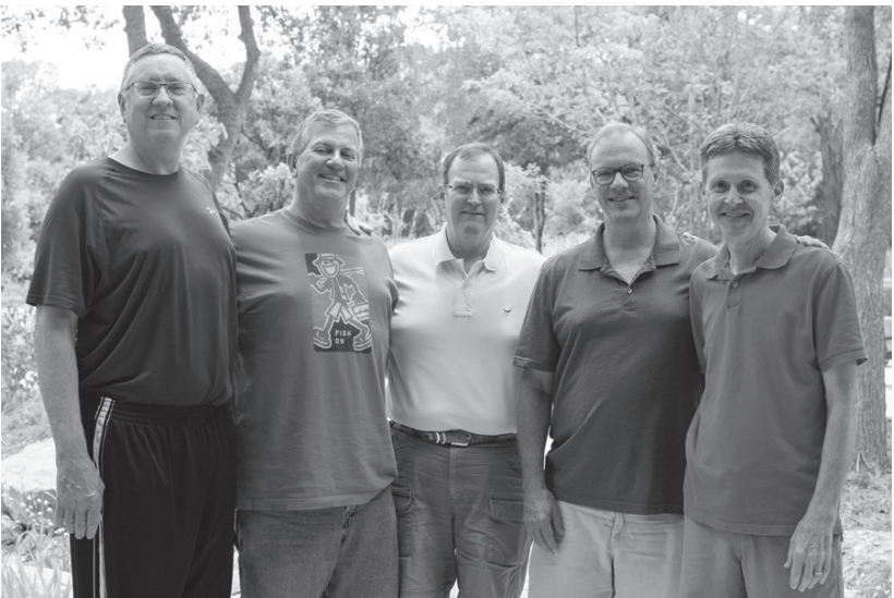
Lifeline’s 5 Chaplains attending a Spirituality Retreat at Laity Lodge