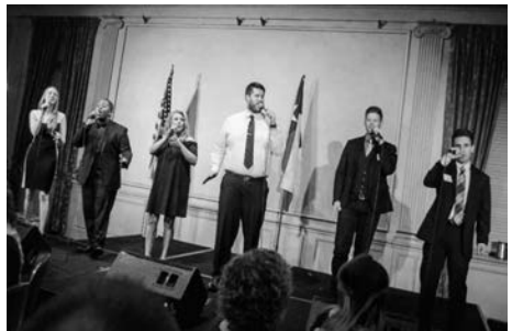
Entertainment by: Compassion