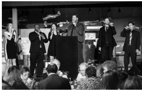
Music by Compassion