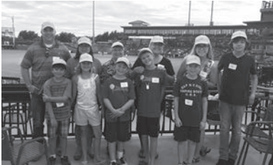
Our Youth Supporting Compassionate Touch

We began this year with much excitement and gratefulness as we celebrated Compassionate Touch's 20th Anniversary. To commemorate this special occasion, a Baseball Fundraiser Event in conjunction with the Sugar Land Skeeters was held on the birthday of our organization. That day's earlier rainstorms ended, opening the skies to perfect weather. A wonderful time was enjoyed by all in attendance.