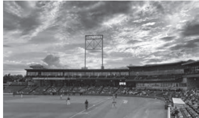
Constellation Baseball Field of Sugar Land Skeeters